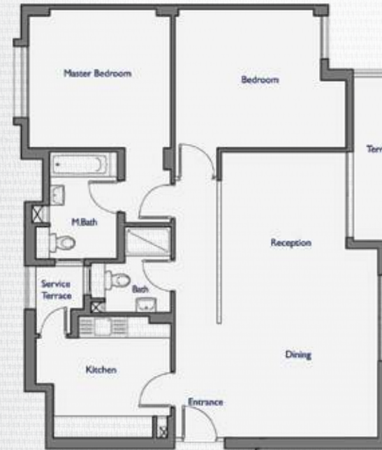
FIRST LEVEL - THIRD FLOOR PLAN