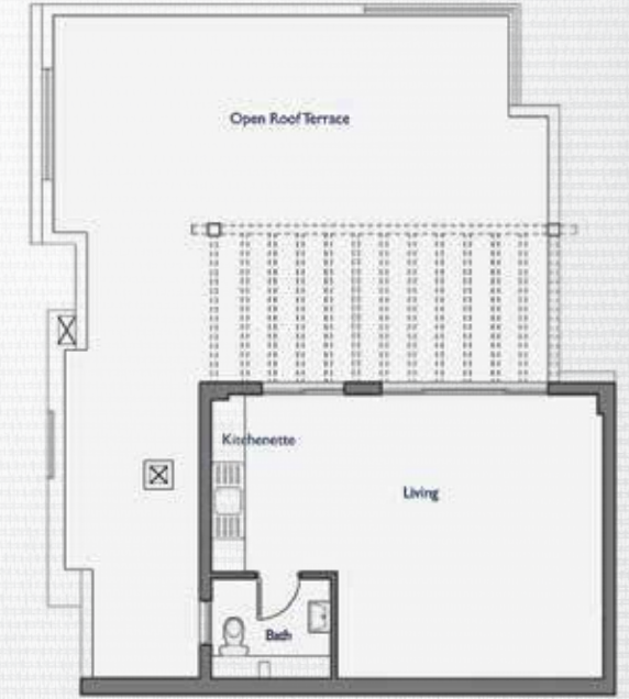
SECOND LEVEL - PENTHOUSE FLOOR PLAN